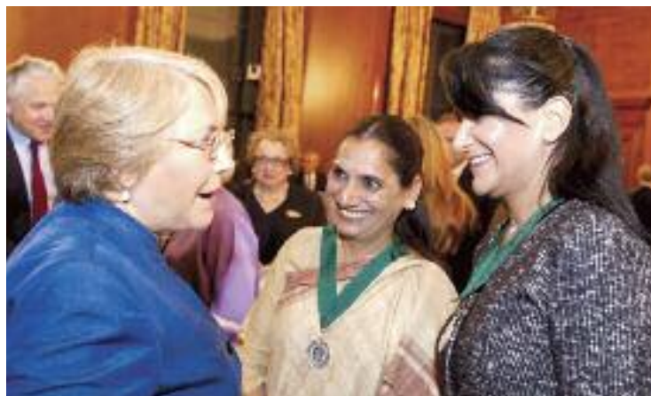
Executive Director of UN Women Michelle Bachelet with CCP Prize-winners

continued from page 1 with brothel keepers" to the "continuous threats and attacks by national and international anti-social elements." She spoke of both the "physical and mental torture" of the victims she rescues leading them to "lose faith in mankind," and the